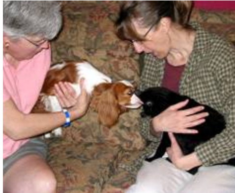
Cavaliers are always curious about kitty cats!