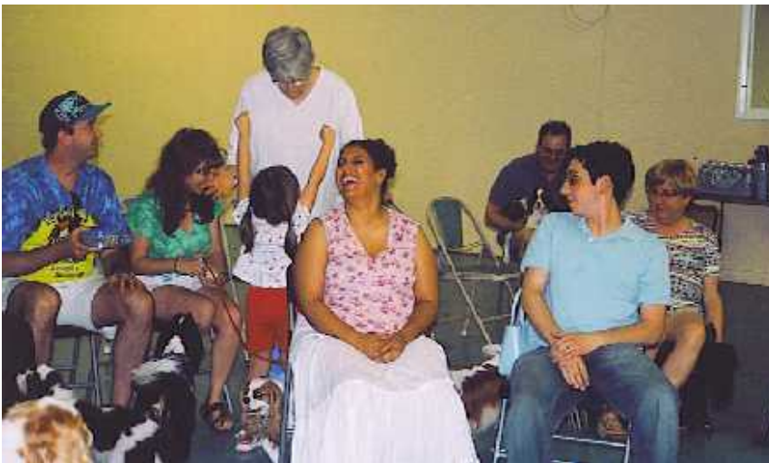
May Meeting of the club.