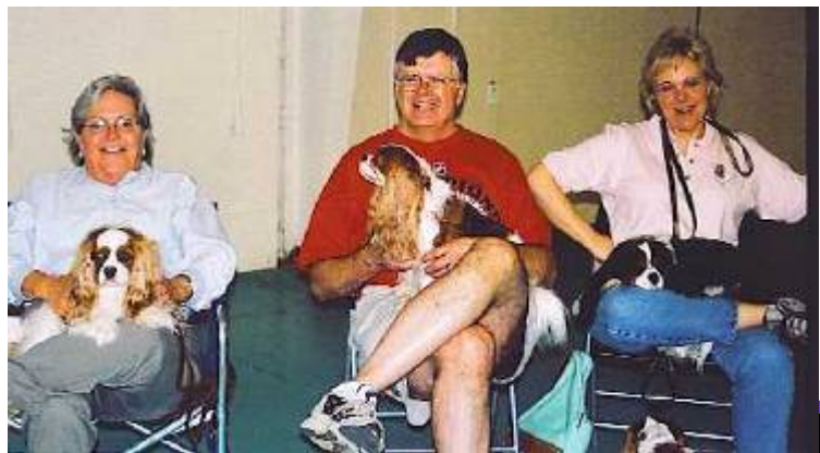
A motley crew!

We're on the web at www.carolinacavaliers.com