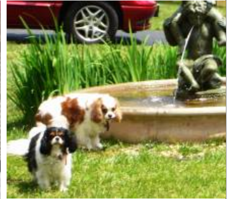
Look! It's a puppy pool!