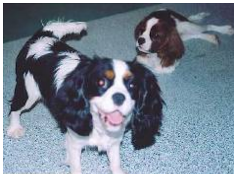
Gwen Wells Elektra